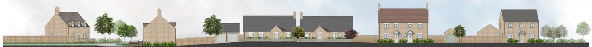
Plot 50 Plot 2 Plot 3 Plot 4 Plot 5 Plot 6 Plot 7 Street Scene B-B / Road behind Harvest Piece, looking South