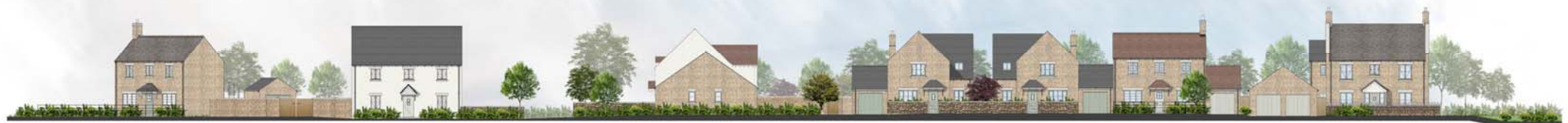
Plot 12a Plots 14/15 Plot 23 Plot 24 Plot 25 Plot 26 Plot 28 Street Scene C-C / Road behind Harvest Piece, looking North