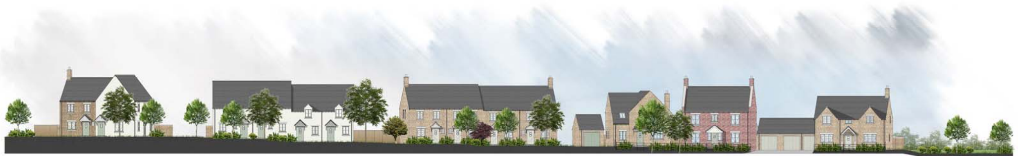
Plot 46 Plots 44/45 Plot 43 Plot 42 Plot 41 Plot 40 Street Scene A-A / East side of development to front POS